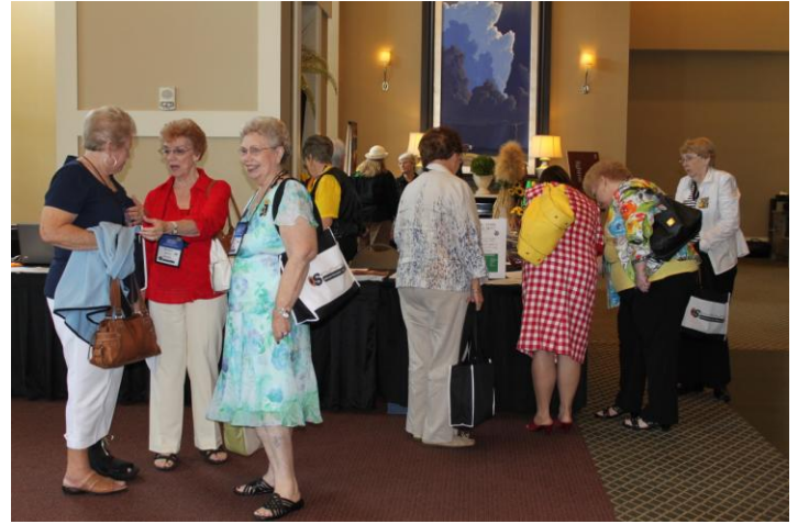
Conventions always have many exhibit tables for the members to browse, shop and talk!