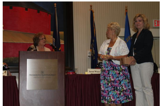
Below: Service awards are always given at convention for 25 years and up! What an honor to recognize our members that give so many years of service to ESA.