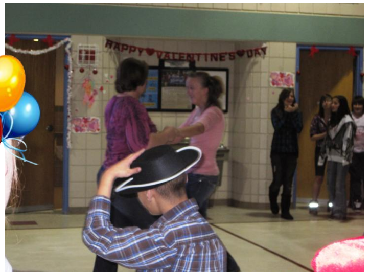
They danced and danced!