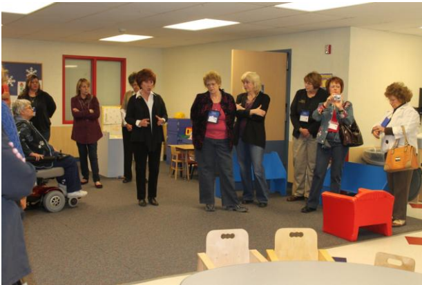
The council tours the facilities' classrooms